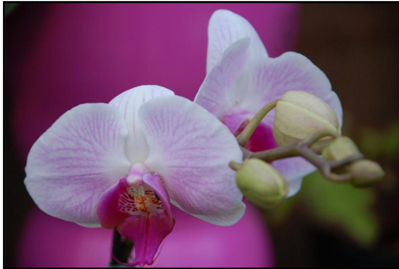
Picture of beautiful orchid